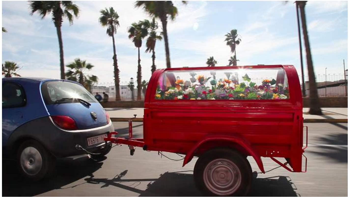
The Mobile Greenhouse. Casablanca, Morocco, 2015.