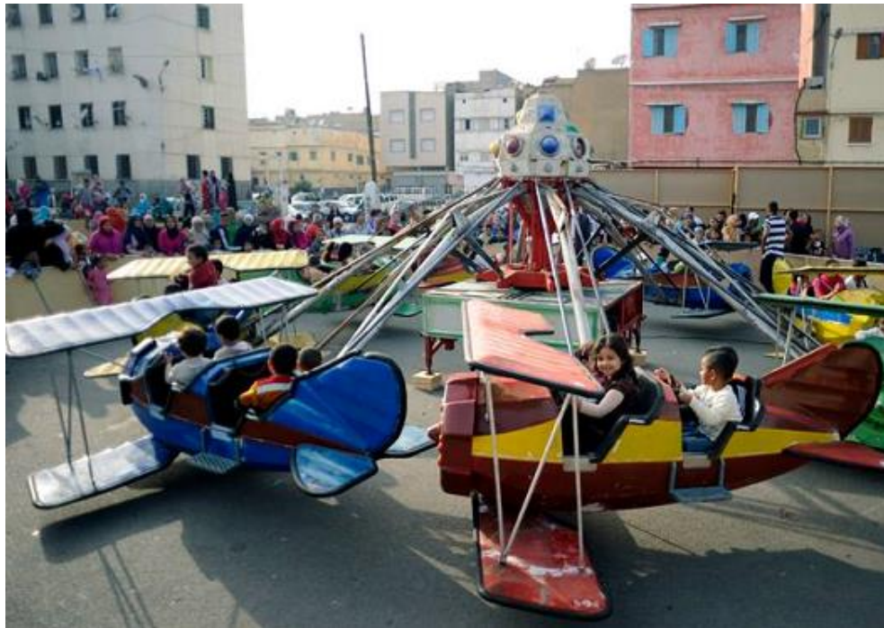
The Respiro Carousel. May 2016.