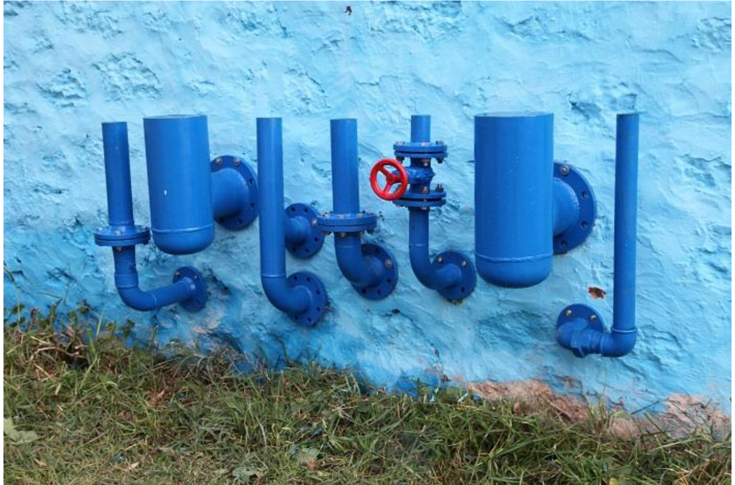
The Cut , Metal industrial pipes, water, 2014.