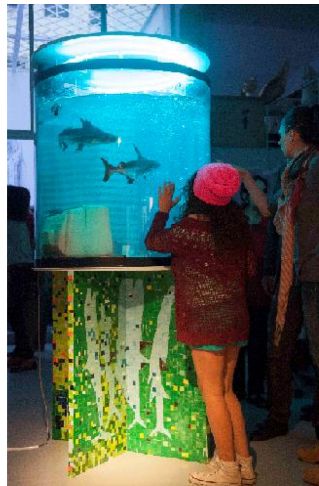
(L) : Replay . Ceramic tiles, paint, mixed media on a pinball machine, 2014. (R) : L'Aqua-Dream . Cylindric aquarium, babysharks, water, and decorative elements, 2014.