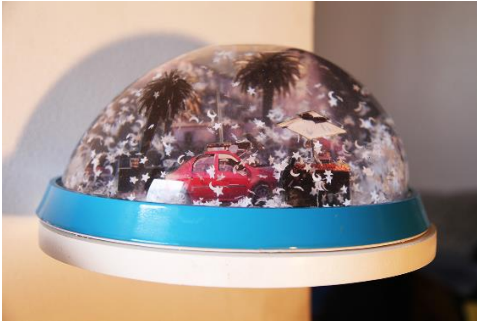
Il neige sur Casablanca (It's Snowing in Casablanca).

Water, wood, plexiglass, printing on plexiglass, 2014.