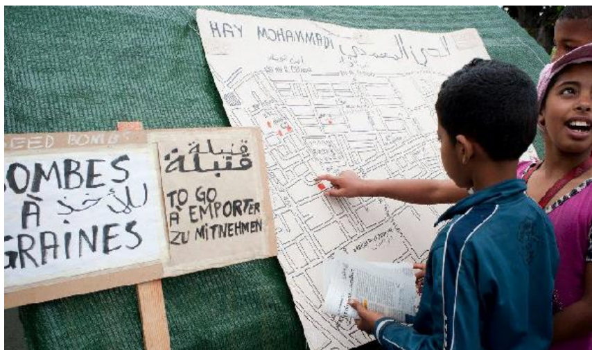
(L) : Greenhouse at the Arab League Park. Casablanca, Morocco, 2015.