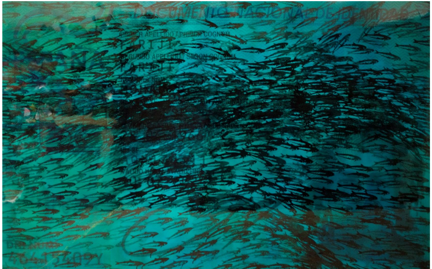
Sardines (Identity Card), 2016.