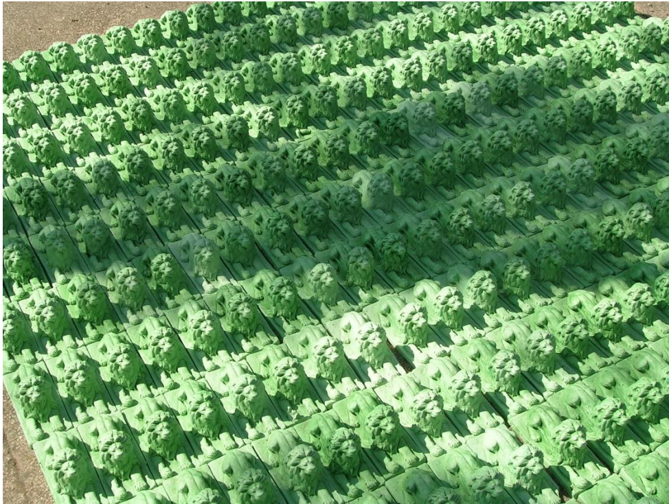
Plaster moulds, 2005.

1001 Lions formed part of the Hermitage Park Project (2002-7), a group effort lead by the Source du Lion (an artist collective based in Casablanca), to rehabilitate the Hermitage Park gardens in Casablanca, Morocco, through performances, discussions, conferences, site specific works, publications, and interventions.