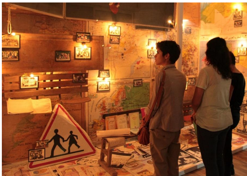
Above : (L) Recovery action at the former Yasmina amusement park. Casablanca, Morocco, 2015.