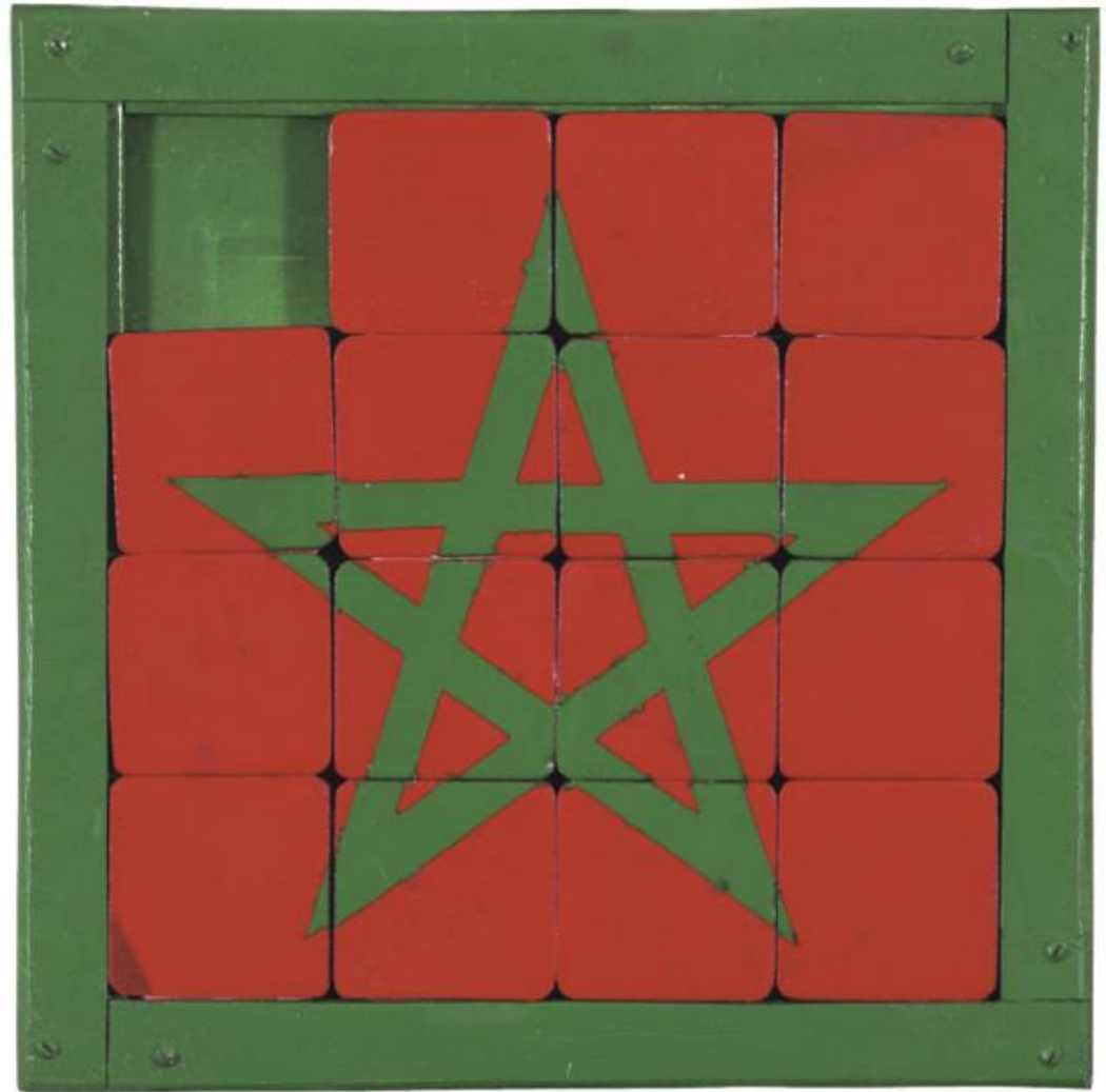
Puzzle. Paint on wood, 2005.